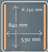
Option 2 x 840 mm seal